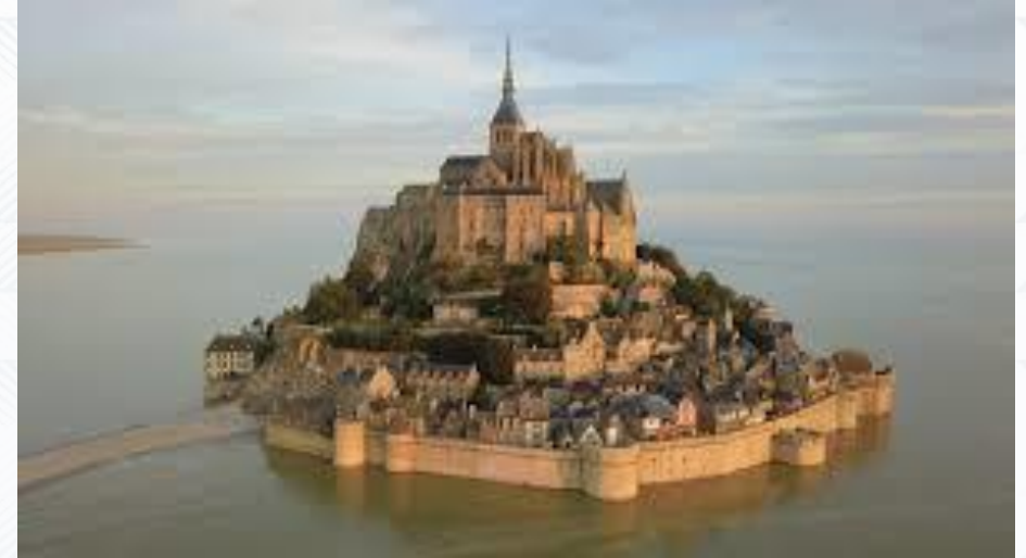
MONT SAINT MICHEL

Before and after the French Trotting Tour, if you wish to extend your stay by a tourist excursion ( Normandy beaches, Paris... )