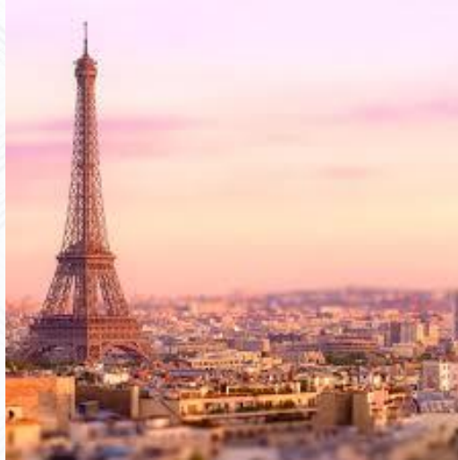
2 FREE DAYS IN PARIS