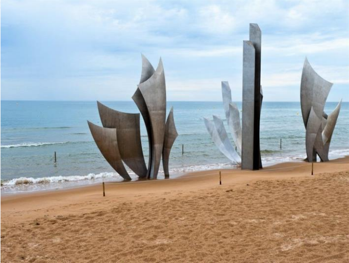
THE D-DAY LANDING BEACHES